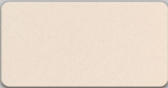
GFRC Sahara Crème