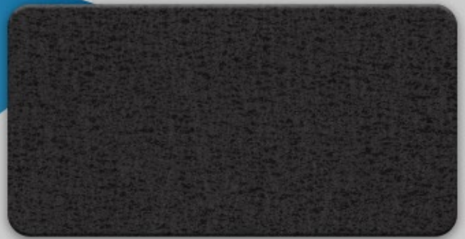
Ceramic Orbit Black