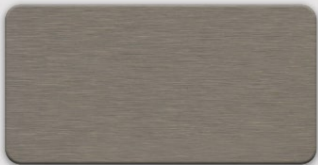
Zinc Light Grey