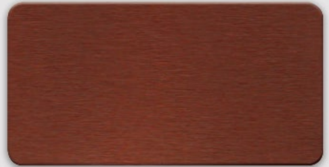
Dark Copper Brushed