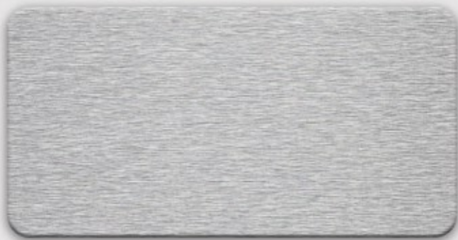
Natural BR Brushed