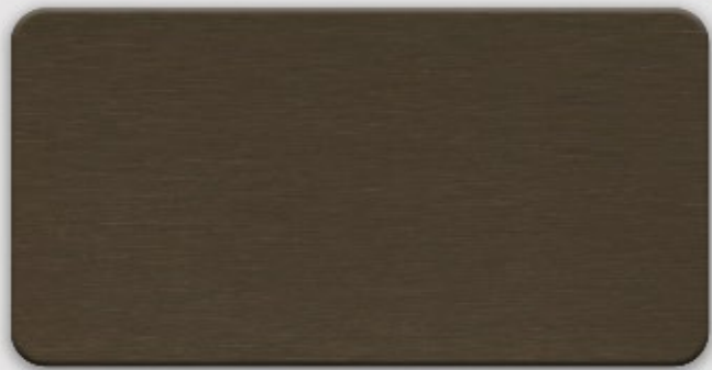
Zinc Dark Brown