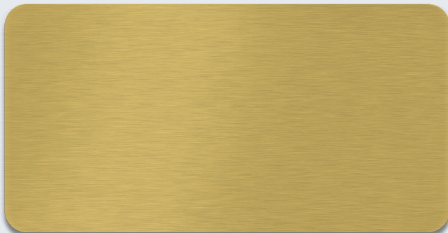
Gold Bright Brushed Anodised