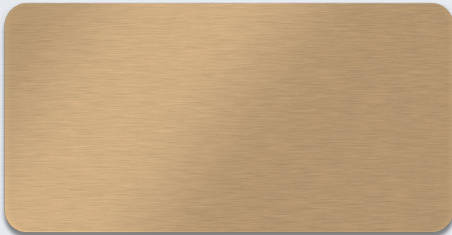
Bronze Bright Brushed Anodised