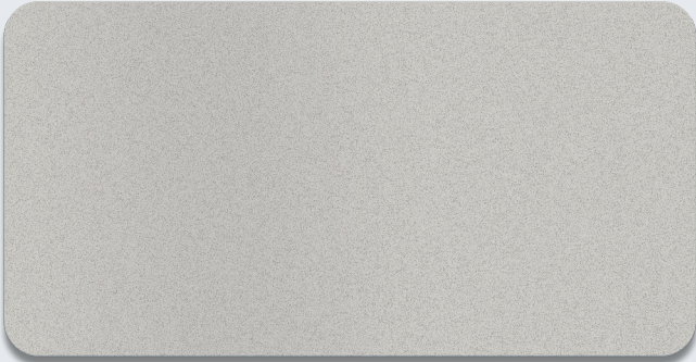
Scatter Gloss Anodised