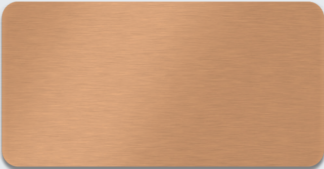
Copper Bright Brushed Anodised