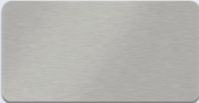
Natural Bright Brushed Anodised